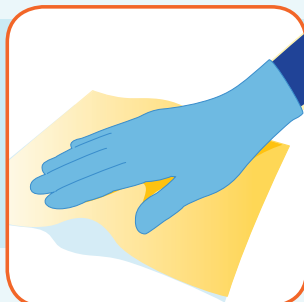
Keep Patient's Environment and Equipment Clean