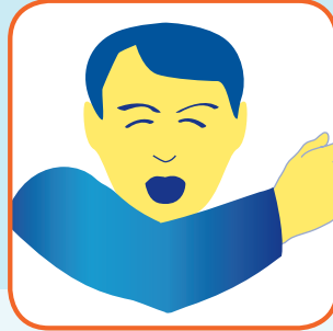
Stay Home if You're Sick