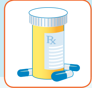
Know If Antibiotics are Appropriate