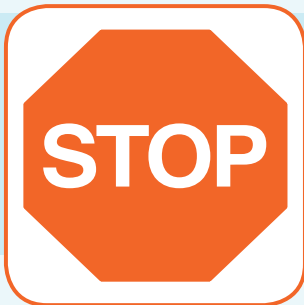
Follow all Posted Precaution Signs