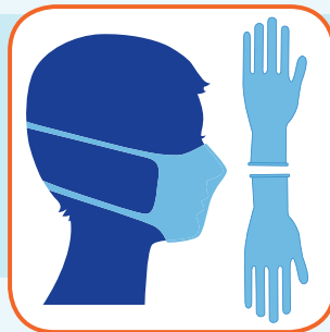
Use Personal Protective Equipment