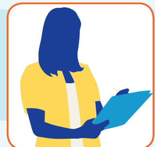
Educate Patients on Infection Prevention

Know Your Facility's Infection Preventionist: